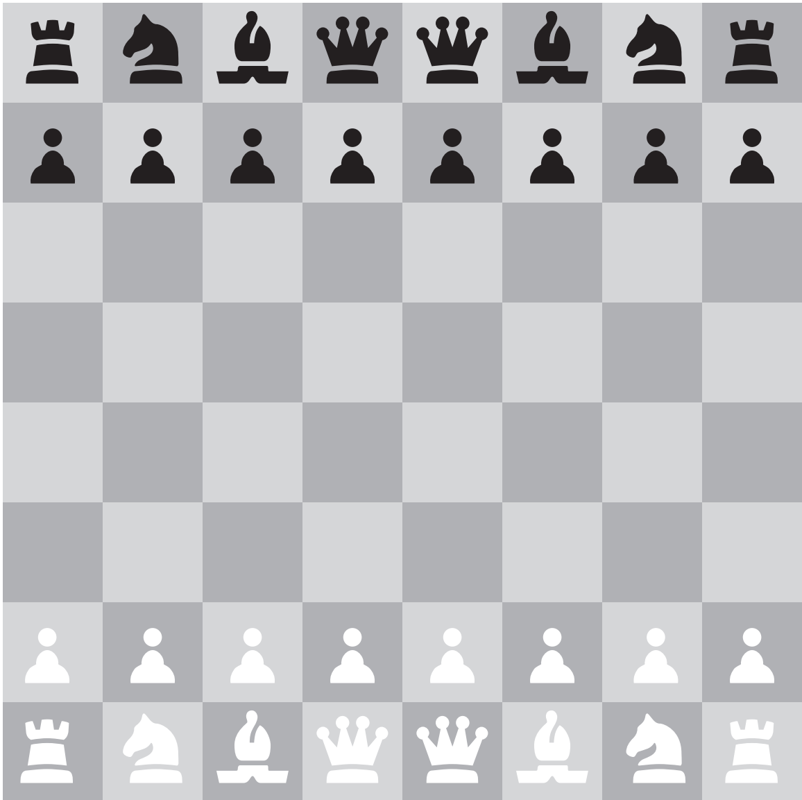
Unwinnable Chess Game No. III (no king)