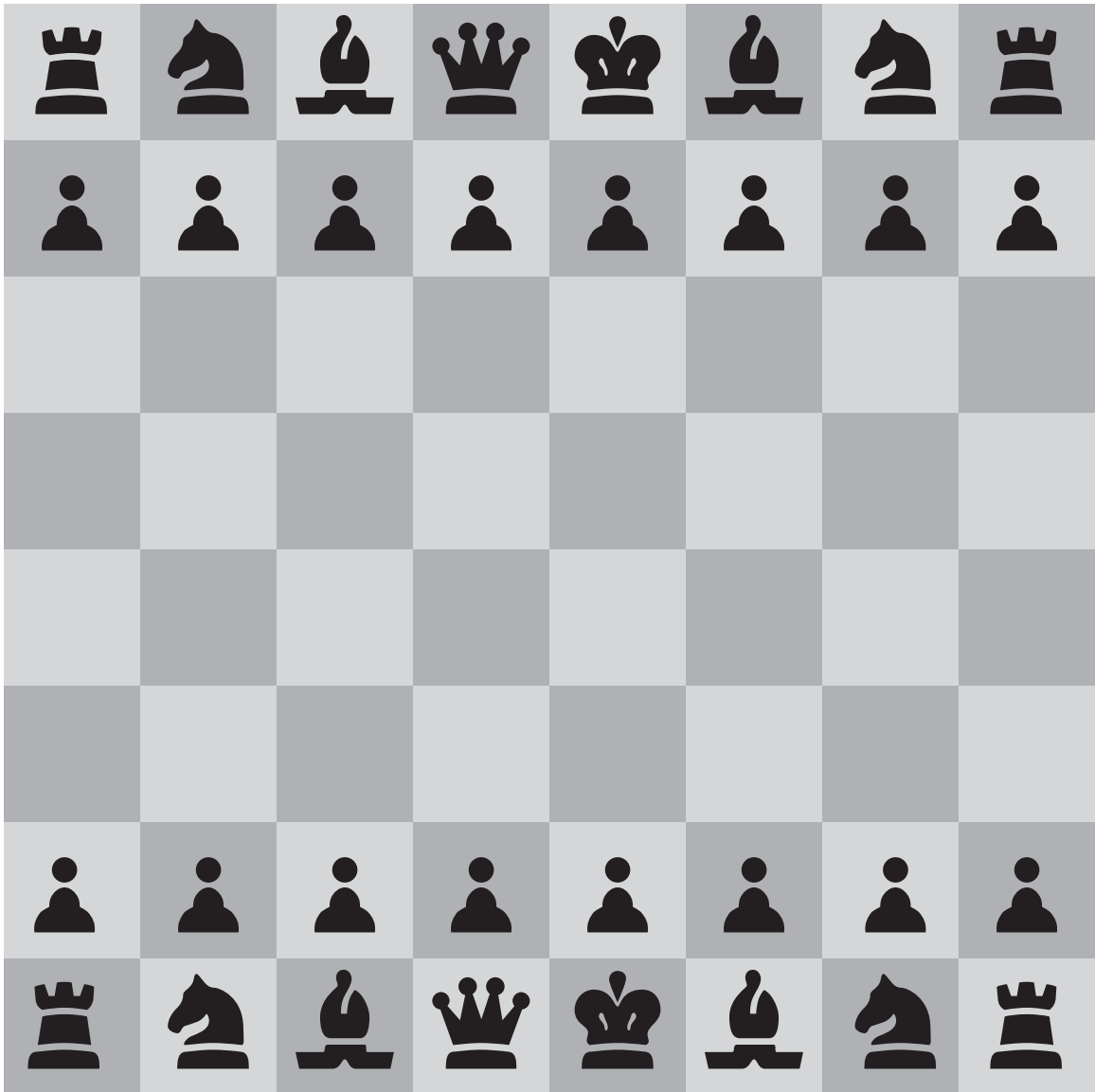
Unwinnable Chess Game No. II (white moves first)